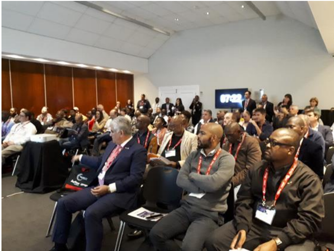
SAAMA Conference audience.