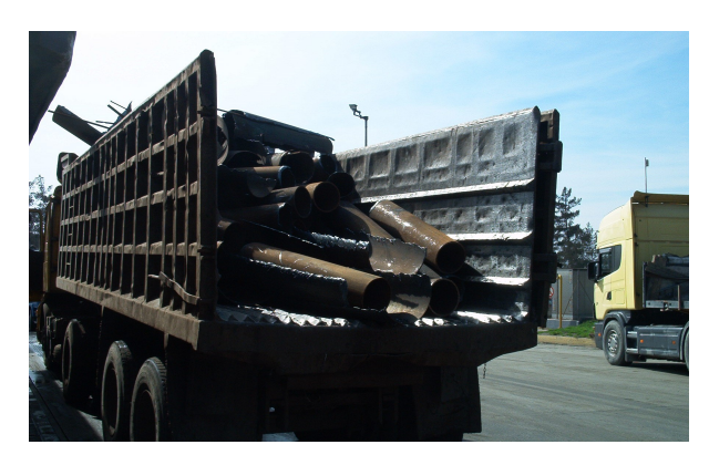
Balancing the loads is not enough for a safe transportation; securing the cargo following the laws of physics is equally important